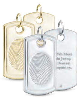
Dog Tag Pendant (Sterling Silver or Gold)

Black Aluminum Ultralight Dog Tag Includes: Ball Chain and Rubber Silencer Lightly Etched