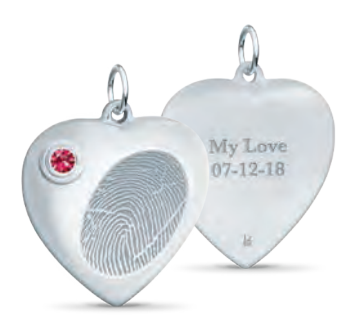
Heart Urn Pendant Shown with January Birthstone Closure