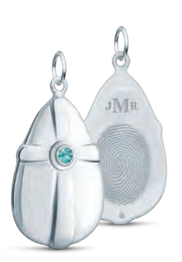
Cross Urn Pendant Shown with December Birthstone Closure