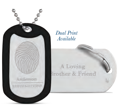
Stainless Steel Military Dog Tag Includes: Ball Chain, Key Ring, and Rubber Silencer

Black Aluminum Ultralight Dog Tag Includes: Ball Chain and Rubber Silencer Lightly Etched