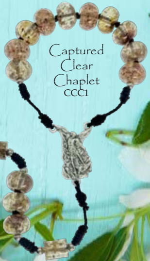
Captured Clear Chaplet CCCI

The Captured Clear Full Rosary and Chaplet are beautiful and durable keepsakes. Your flower beads are strung and hand knotted on nylon rosary cord and accented by stainless steel beads. They feature a St. Michael defeating Lucifer centerpiece and a rugged cucifix of nails.