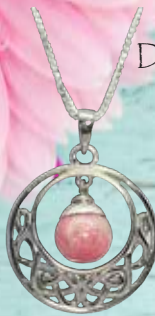
NDPI-TCB Measures 1.75" diameter