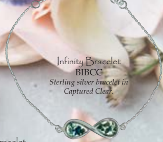
Infinity Bracelet BIBC Sterling silver bracelet in Captured Clear.

This stainless steel heart bracelet features your flowers in Captured Clear.