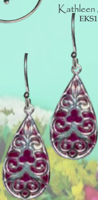
Kathleen Swirl EKS1