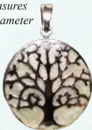
Tree of Life NTOL1 Measures 1" diameter