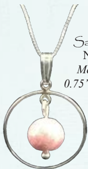
Samantha NSM2 Measures 0.75" diameter