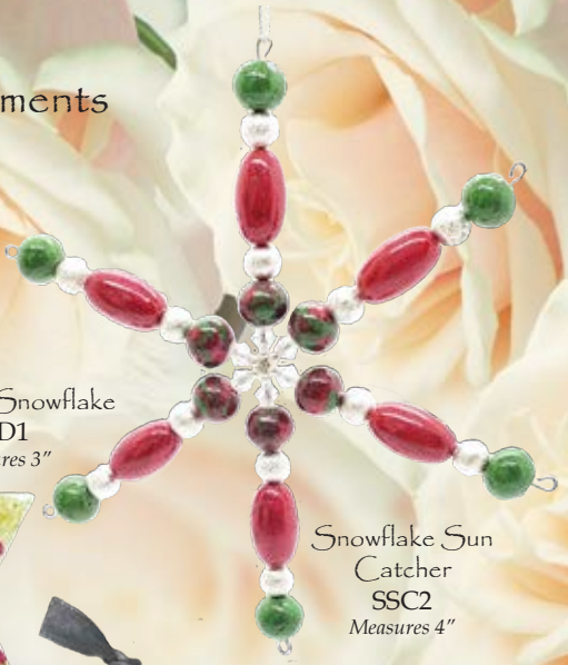
Snowflake Sun Catcher SSC2 Measures 4"