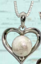
NOHP1-TCB Measures 0.75" long