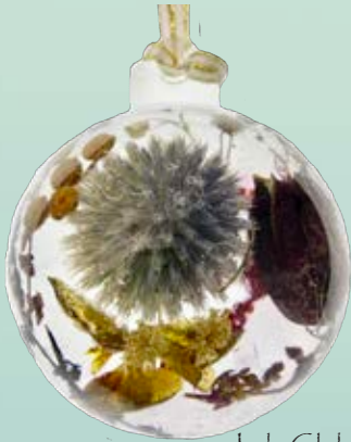
Judy Globe Ornament JGO1 Measures 3" Half Sphere