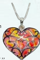
Elizabeth Heart NSHE1 Measures 0.75" x 0.5" long