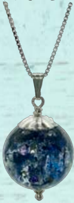
Carlie Globe Pendant NCG1 Measures 5/8"