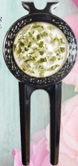
Denny Golf Tool in Captured Clear DGTTCC1