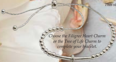
Bolo Curve Bracelet BCB2

Choose the Filigree Heart Charm or the Tree of Life Charm to complete your bracelet.