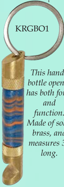
Gus Bottle Opener Key Ring