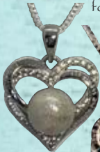
NRHP1-TCB Measures 0.75" long