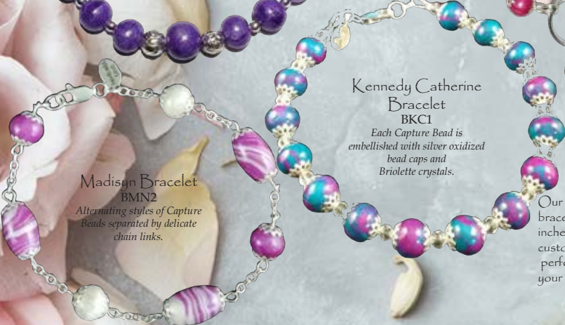
Madison Bracelet BMN2

Each Capture Bead is embellished with silver oxidized bead caps and Briolette crystals.