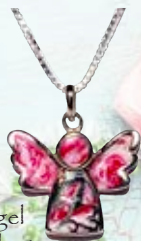
Angel Pendant NAP1 Measures 0.6" x 0.7" long