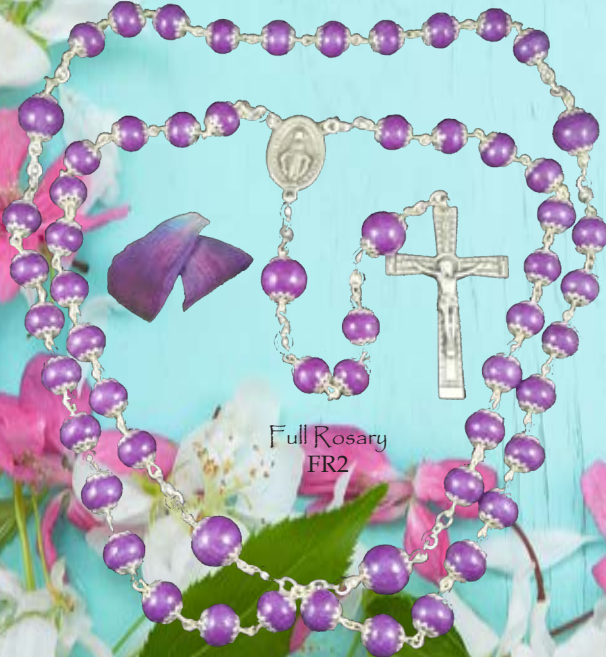
Full Rosary FR2

Rosaries can be made with one color or with up to three colors. If more than one color is selected, please let us know if you would like your beads marbled or alternating solid color beads.