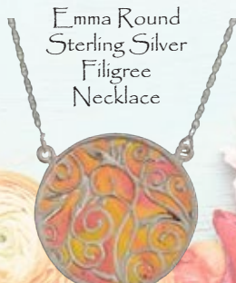
Emma Round Sterling Silver Filigree Necklace NERF1 Measures 0.75" diameter