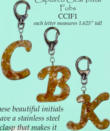
Captured Clear Initial Fobs CCIF1 each letter measures 1.625" tall

These beautiful initials have a stainless steel clasp that makes it perfect to adorn your purse or backpack.