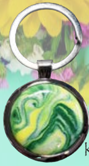
Round Key Ring KRR1

This clever key fob has a secret compartment for matches, toothpicks, or a little emergency cash. Available in 24kt gold plate, or brushed silver hardware.