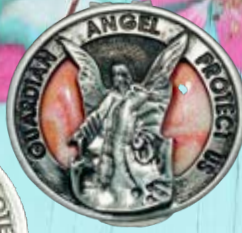
Guardian Angel Visor Clip Single VCGA1 Measures 2"

These visor clips for your car feature St. Christopher, the patron saint of travelers, and a Guardian Angel each backed with your Capture Bead flowers.