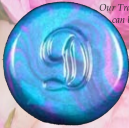
Pocket Stone PS2

Our Traditional Capture Bead pocket stones can be left smooth or embossed with a single large initial or up to 4 small letters.