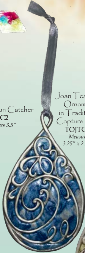
Joan Teardrop Ornament in Traditional Capture Bead TOJTCB1 Measures 3.25" x 2.125"