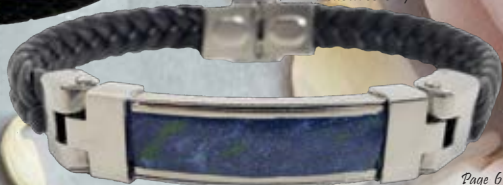
Tyler Bracelet BSSLT Measures 8 1/2"