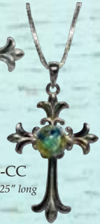
NGC1-CC Measures 1.25" long