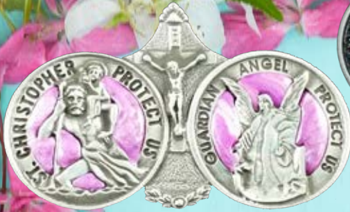
St. Christopher Visor Clip SCVCI Measures 2" x 3"

These visor clips for your car feature St. Christopher, the patron saint of travelers, and a Guardian Angel each backed with your Capture Bead flowers.