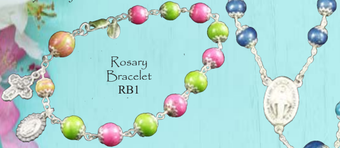
Rosary Bracelet RB1

The Rosary Bracelet allows you to wear your faith on your wrist. Made with one full decade, one Our Father bead, and one Glory Be bead, and finished with an oxidized silver miraculous medal and a five-way medal.