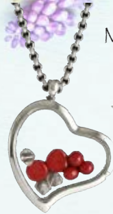
Memory Locket Heart MLHRT1 Measures 1" long

These beautiful Memory Lockets come filled with tiny round and disk shaped Traditional Capture Beads, and crystal briolettes. Each necklace comes on an 18" stainless steel rolo chain with a 2" extender.