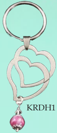
Double Heart Key Ring