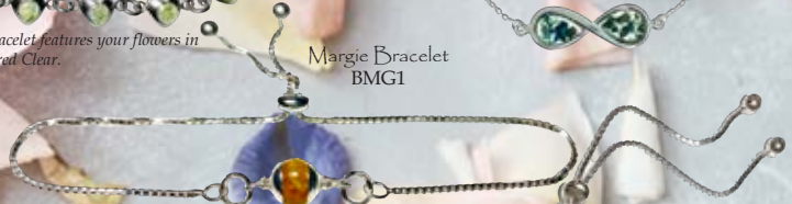
Margie Bracelet BMG1

This sterling silver adjustable bolo bracelet is elegant in its simplicity with a single Captured Clear Bead.