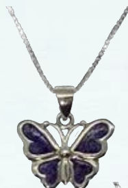
Butterfly Pendant NBP1 Measures 0.5" x 0.75" long