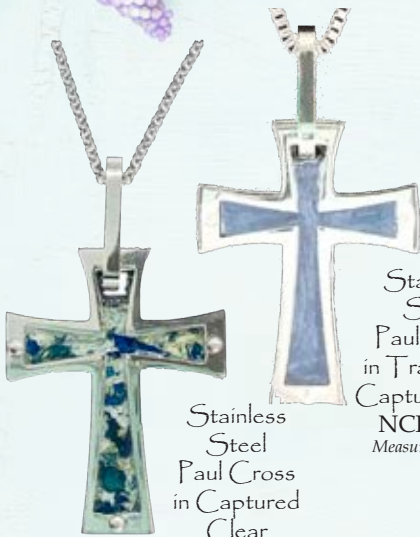
Stainless Steel Paul Cross in Captured Clear NCPICC Measures 2" long

The Paul Cross can be made in Traditional Capture Bead or Captured Clear. Each necklace comes on an 18" stainless steel rolo chain with a 2" extender.