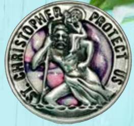
St. Christopher Visor Clip Single VCSCI Measures 2"