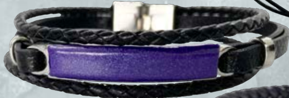
James Bracelet BSSLJ Measures 8 3/4"