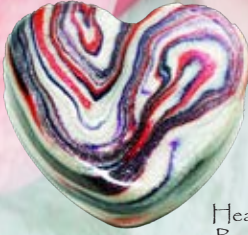
Heart Shaped Pocket Stone HSPS1

These Captured Clear resin pocket stones show off your flower petals beautifully. Measures approximately 1.25 x 1.25 inches