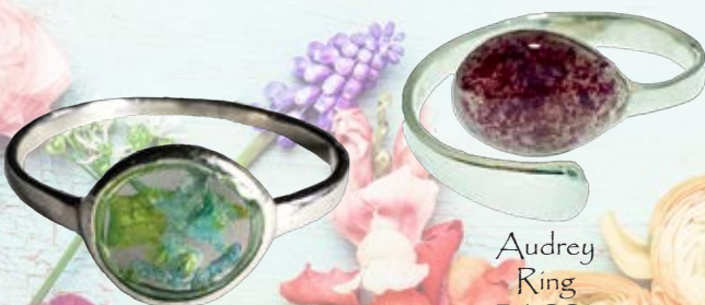
Nikee Ring RNCCI