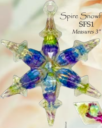
Spire Snowflake SFS1 Measures 3"