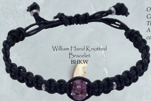
William Hand Knotted Bracelet BHKW

Our hand knotted bracelets feature our waterproof Captured Clear Beads and stainless steel accents. They are adjustable and can be made to fit any size wrist. All styles are available in your choice of leather, waxed cotton, or synthetic cord.