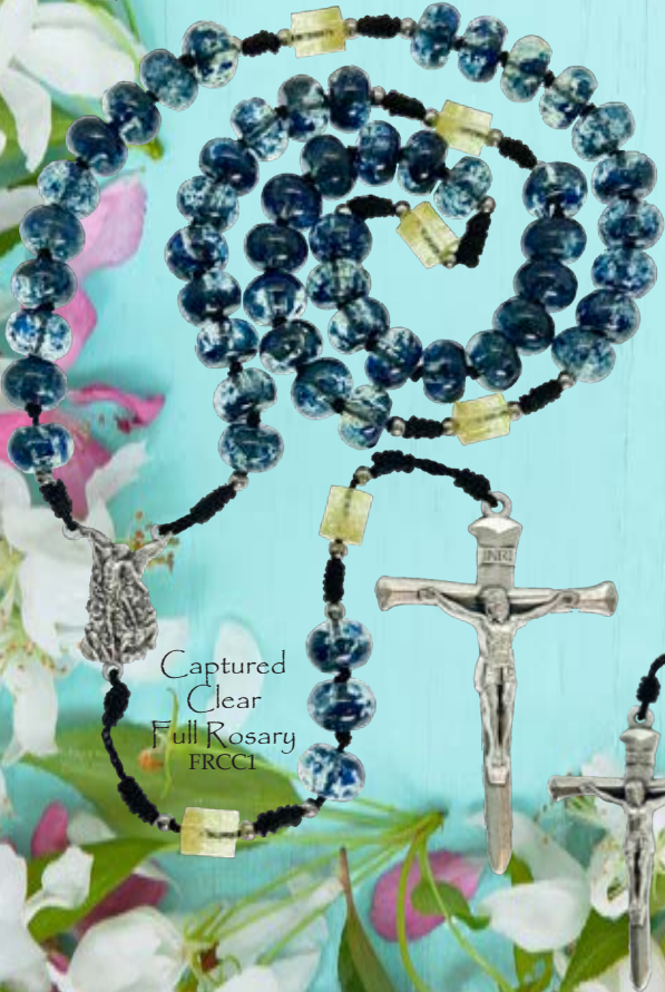
Captured Clear Full Rosary FRCCI

The Captured Clear Full Rosary and Chaplet are beautiful and durable keepsakes. Your flower beads are strung and hand knotted on nylon rosary cord and accented by stainless steel beads. They feature a St. Michael defeating Lucifer centerpiece and a rugged cucifix of nails.