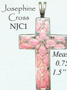
Josephine Cross NJC1 Measures 0.75" x 1.5" long