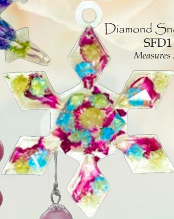
Diamond Snowflake SFD1 Measures 3"