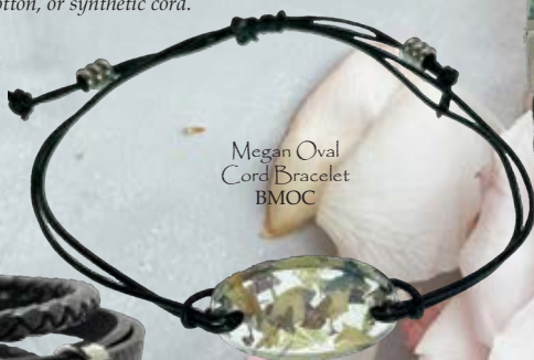
Megan Oval Cord Bracelet BMOC

Our hand knotted bracelets feature our waterproof Captured Clear Beads and stainless steel accents. They are adjustable and can be made to fit any size wrist. All styles are available in your choice of leather, waxed cotton, or synthetic cord.