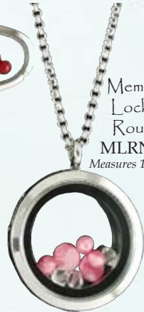
Memory Locket Round MLRND1 Measures 1.5" long