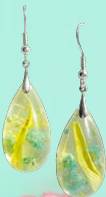
Eileen Teardrops EET1