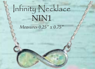
Measures 0.25" x 0.75"