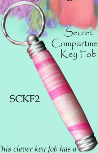
Secret Compartment Key Fob