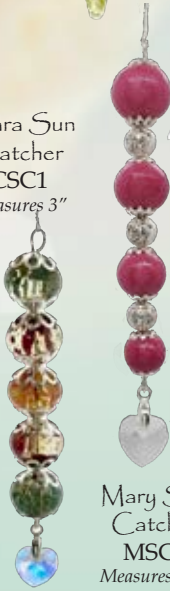
Mary Sun Catcher MSC2 Measures 3.5"