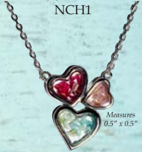
Measures 0.5" x 0.5"