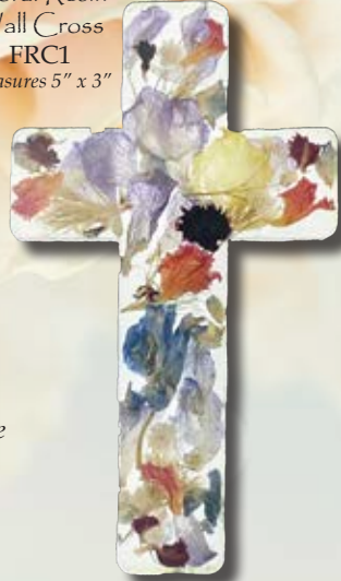
Floral Resin Wall Cross FRC1 Measures 5" x 3"