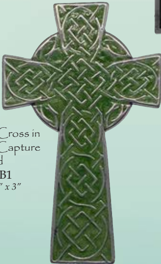
Celtic Wall Cross in Traditional Capture Bead CCTCB1 Measures 5" x 3"