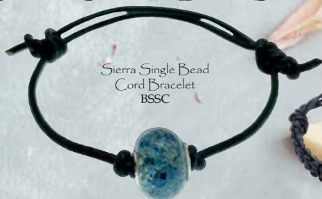
Sierra Single Bead Cord Bracelet BSSC