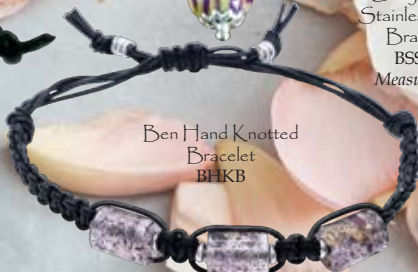
Ben Hand Knotted Bracelet BHKB